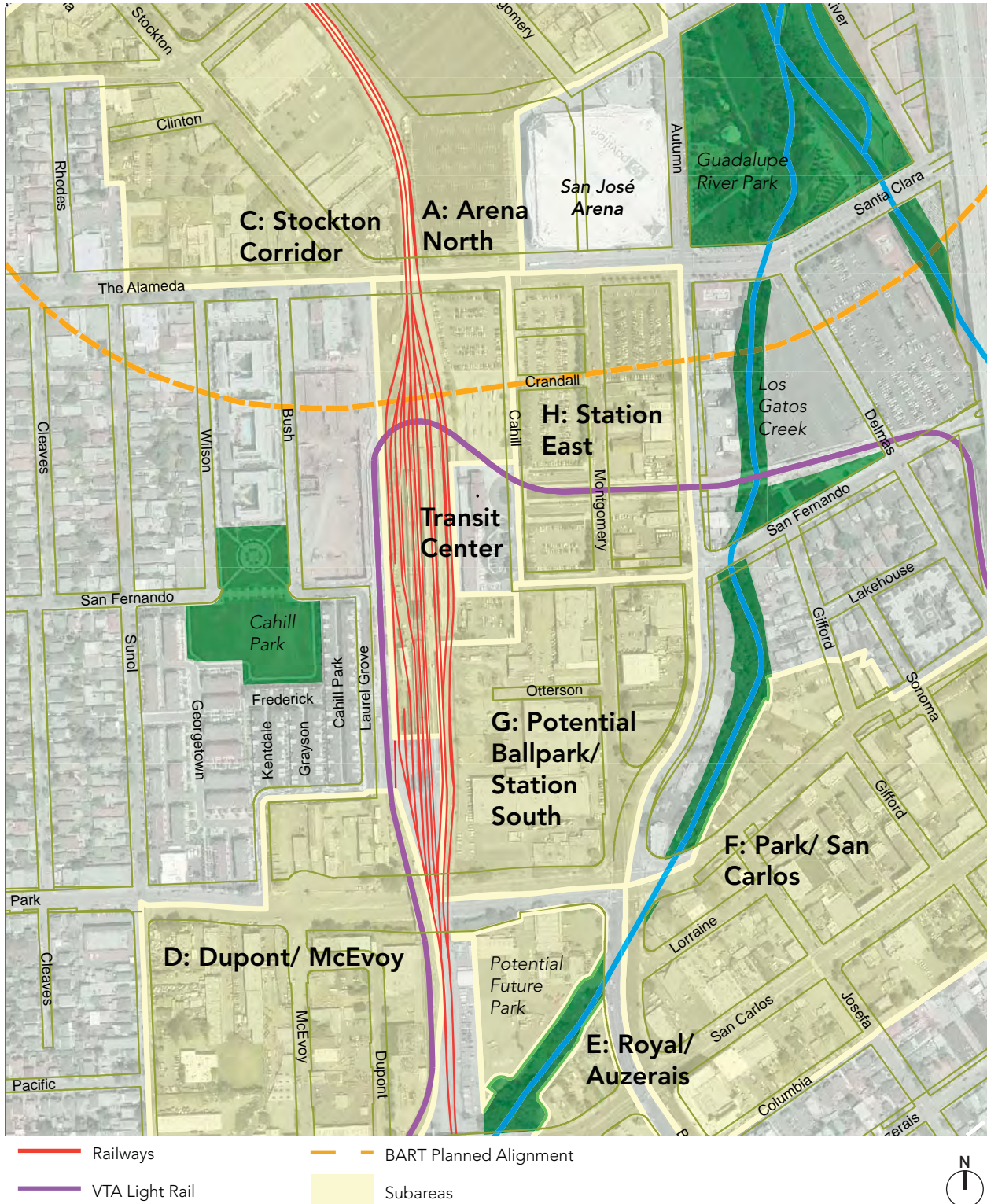
FIGURE I-2-2: DIRIDON STATION AREA