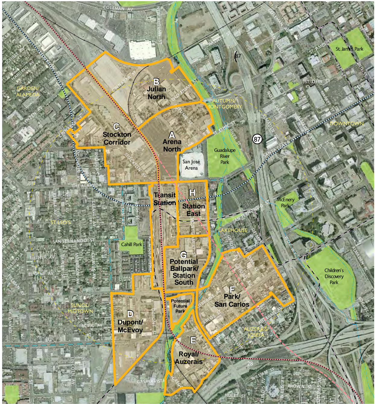
FIGURE I-2-1: DIRIDON STATION AREA IN CONTEXT