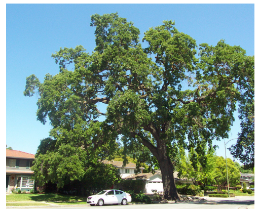
Right: Example of a heritage tree.