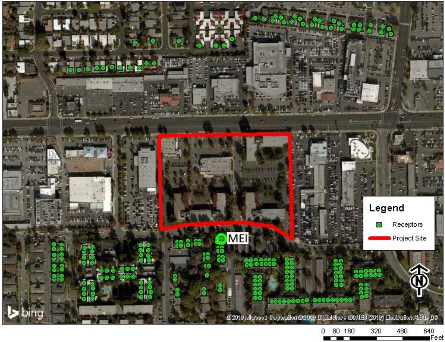
Figure 2. Project Construction Site and Locations of Sensitive Receptors and Maximum TAC and PM 2.5 Impacts