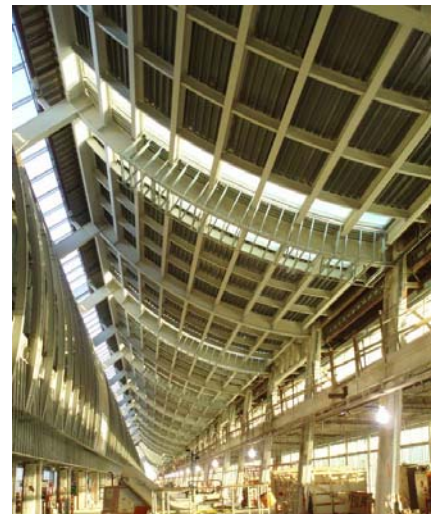
North Concourse Interior – Under Construction