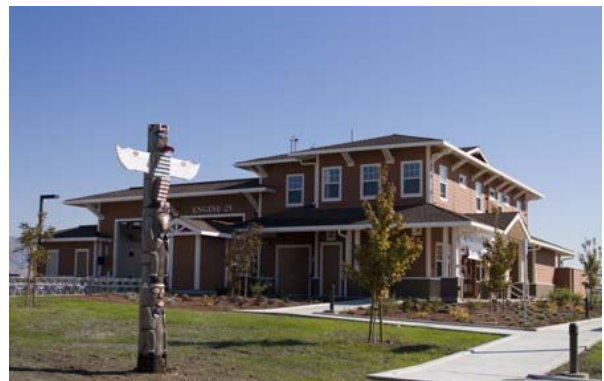
Fire Station 25 - Alviso

The major investment in Public Safety infrastructure included in this CIP is made possible because the voters in San José supported