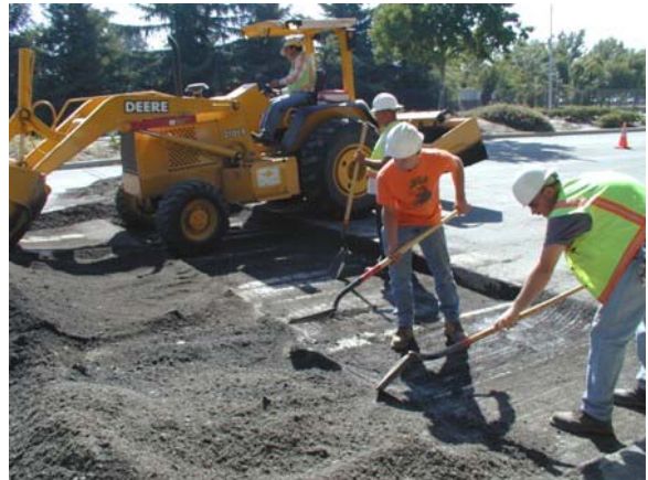
Street Surface Pavement Maintenance

The investments approved as part of the 2009-2013 Adopted CIP include funding for the City's local system expansion ($14.5 million); safety and efficiency projects ($39.8 million); North San José projects ($21.8 million); support for the City's contribution to regional system expansion ($14.3 million); maintenance and rehabilitation activities including bridge and pavement maintenance ($101.9 million); activities that promote community livability including land management, weed abatement, the under-grounding of City utilities, and monitoring of environmental mitigation sites ($8.9 million); local and regional planning and engineering activities ($19.8 million); project and program support ($13.2 million); and reserves and transfers ($70.9 million).