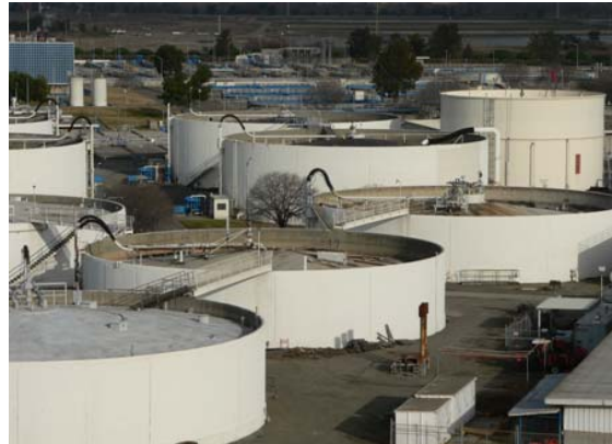
Water Pollution Control Plant – Digester Tanks