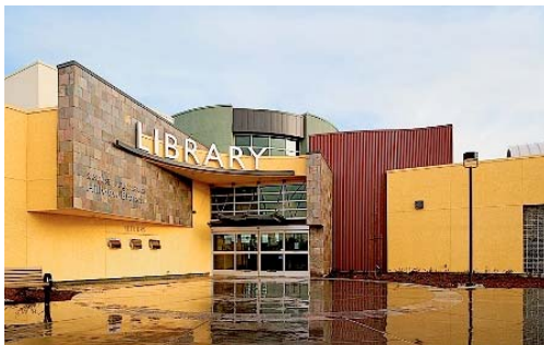
Hillview Branch Library

The City's library system has been undergoing a major transformation as a result of the November 2000 voter-approved bond measure that approved the issuance of $212 million in General Obligation bonds to improve the branch library system over a ten year period. This bond measure provided funding for the reconstruction or replacement of 14 of the 17 existing branches and the construction of six new branches in unserved neighborhoods. Major projects in the CIP and issues are discussed below.