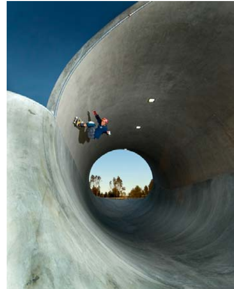
Lake Cunningham Skate Park

The Parks and Community Facilities Development Capital Program plans for and implements the acquisition, development, and protection of parks, recreation facilities, and open space to maintain a high quality of life in San José. Under the direction of the Parks, Recreation and Neighborhood Services Department, the program provides oversight of the planning and development for approximately 3,500 acres of parks (regional/city-wide and neighborhood/community) and open space in the City's sphere of influence. In addition, the City has plans for implementation of a trails and greenways system that will provide a 100-mile network of hiking, biking, jogging, and equestrian trails along the Guadalupe River, Coyote Creek and Los Gatos Creek, Penitencia Creek, Saratoga/San Tomas Creek, and all major feeder streams.