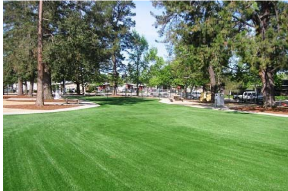
Butcher Dog Park