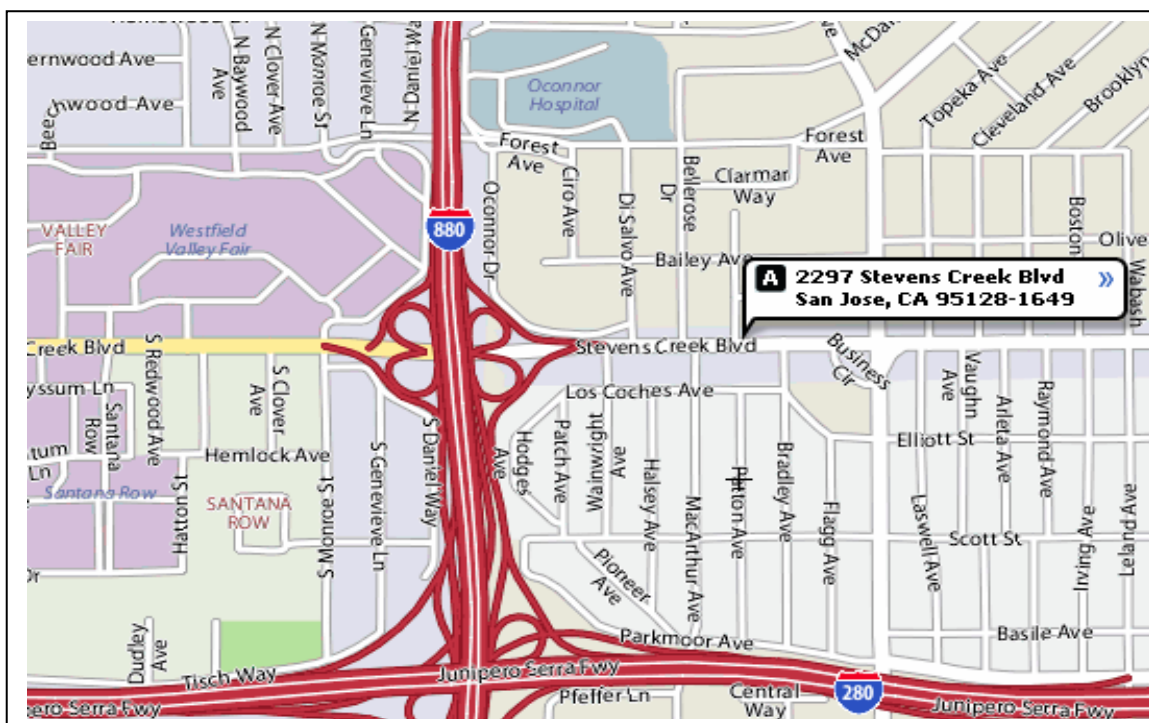
“KOREAN PLACE” SCOPING MEETING LOCATION MAP