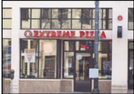
Downtown sign #3 – just the right amount