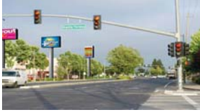
Electronic sign #2