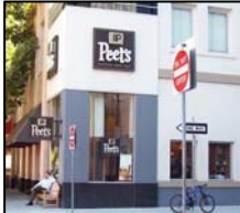
Downtown sign #1