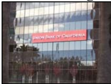
Downtown sign #5