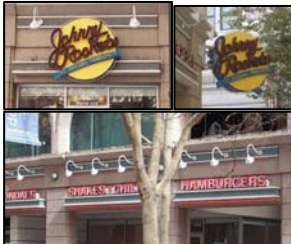
Downtown sign #2