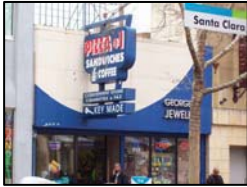
Downtown sign #4