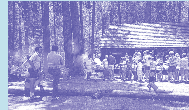
Nature oriented craft activities daily at the craft center.