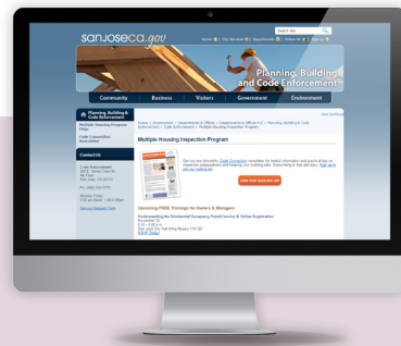
An Online Renewal Guide is available on our Multiple Housing Inspection Program web page.

Are you meeting the requirements to maintain your service level?