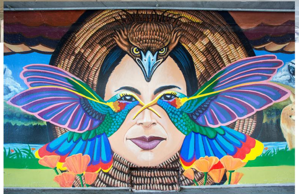
We Are Muwekma Ohlone 10 x 56 ft 2021 Guadalupe River Park, San Jose