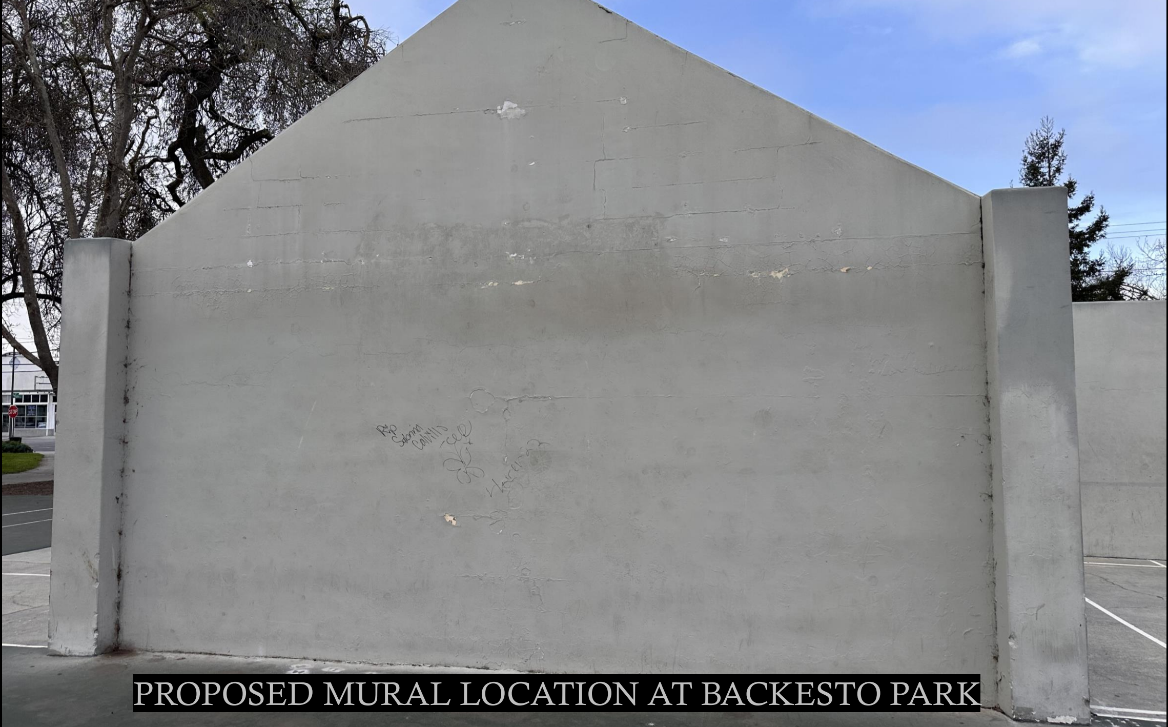
PROPOSED MURAL LOCATION AT BACKESTO PARK