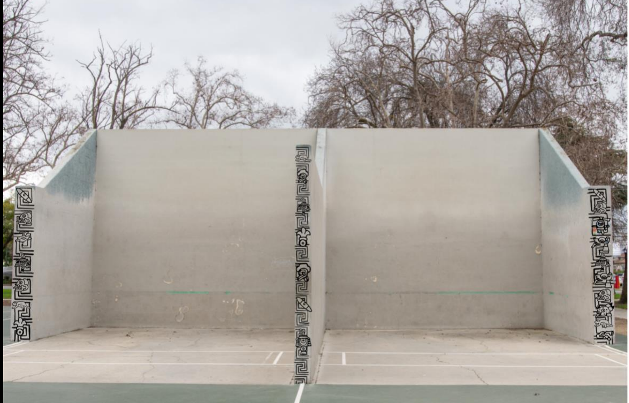
MURAL DESIGN MOCK-UP – NORTH FACING WALL OF HANDBALL COURT