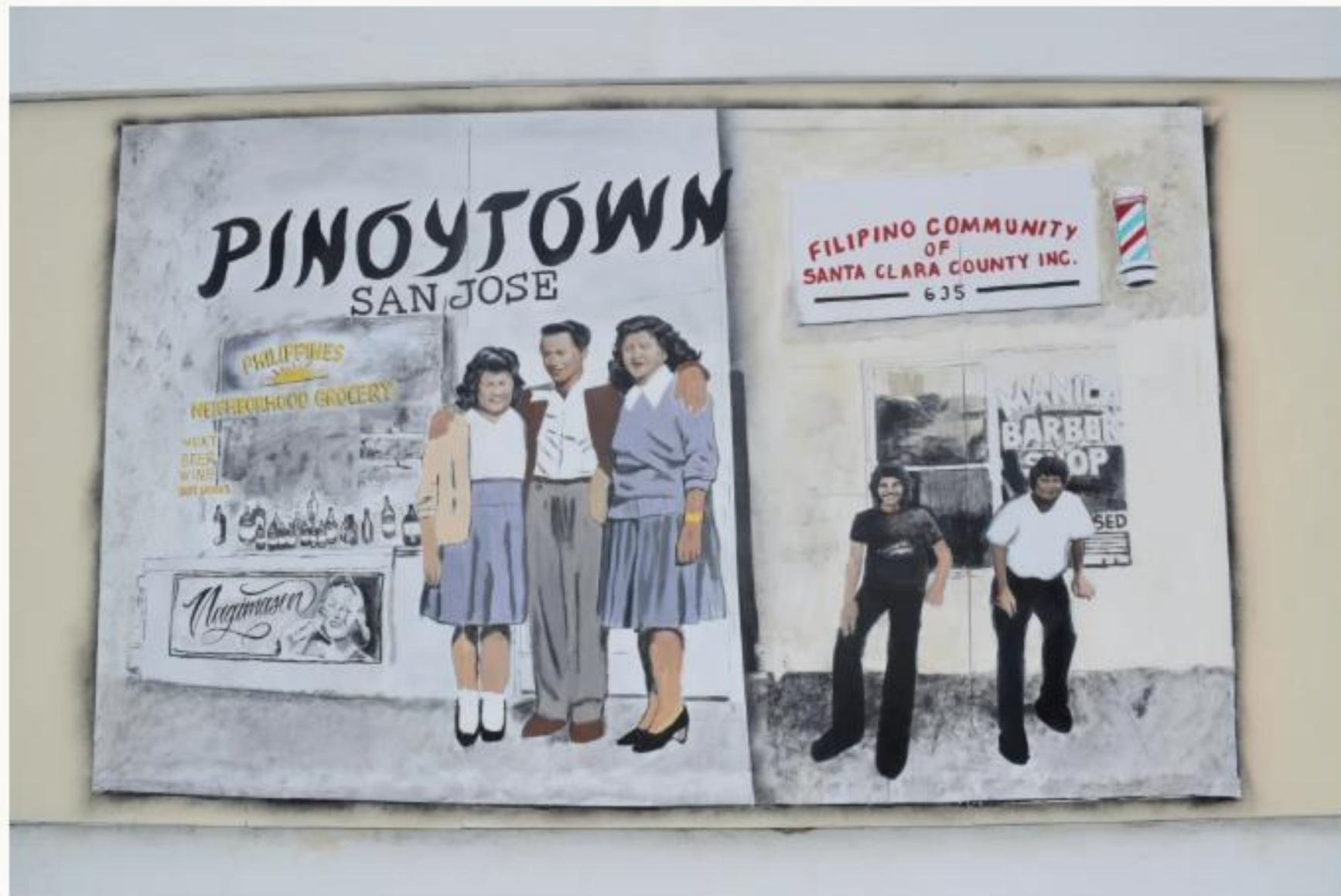
Pinoytown mural finished February 13, 2024