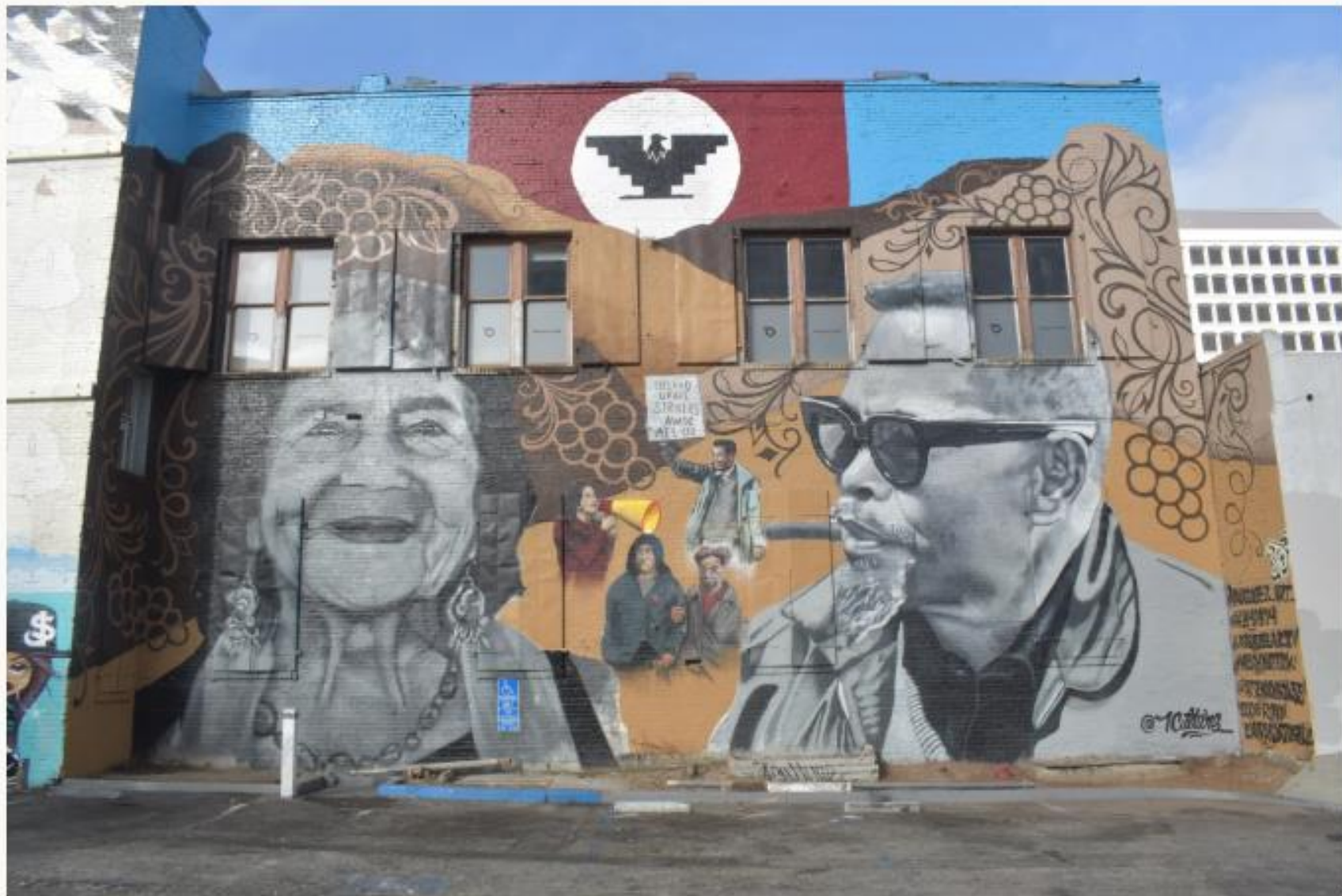
Larry Itliong & Dolores Huerta Mural in San Jose @ 4th & Santa Clara Streets SJ (Chevron Station)