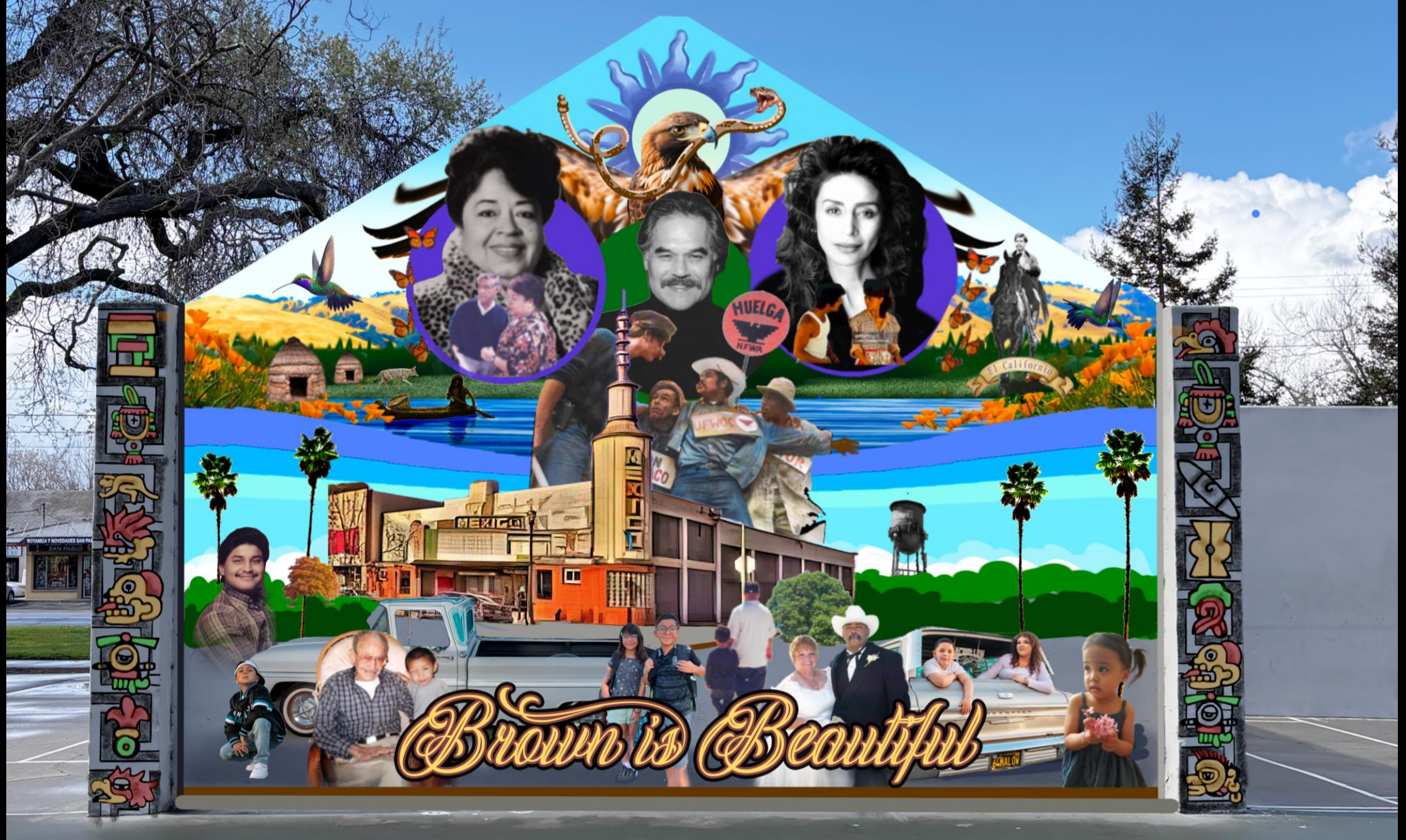
MURAL DESIGN MOCK-UP – EAST FACING WALL OF HANDBALL COURT