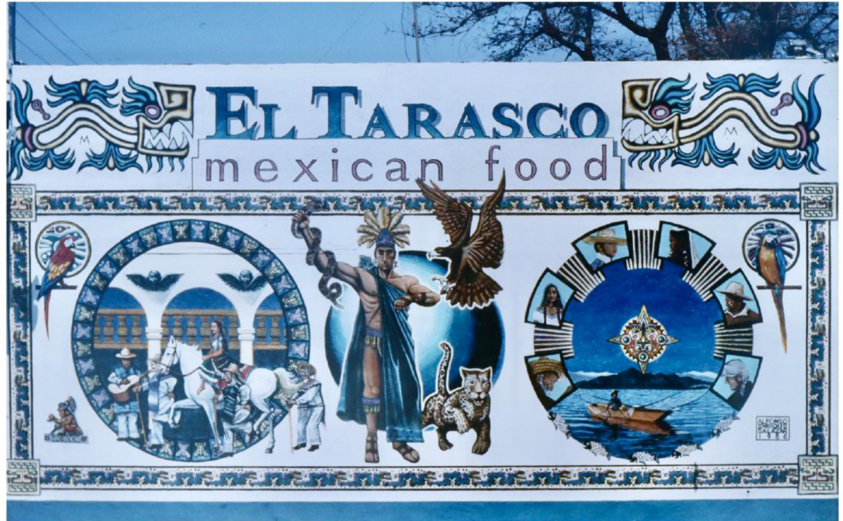
El Tarasco 11 x 22 ft 1986 -2011 San Jose