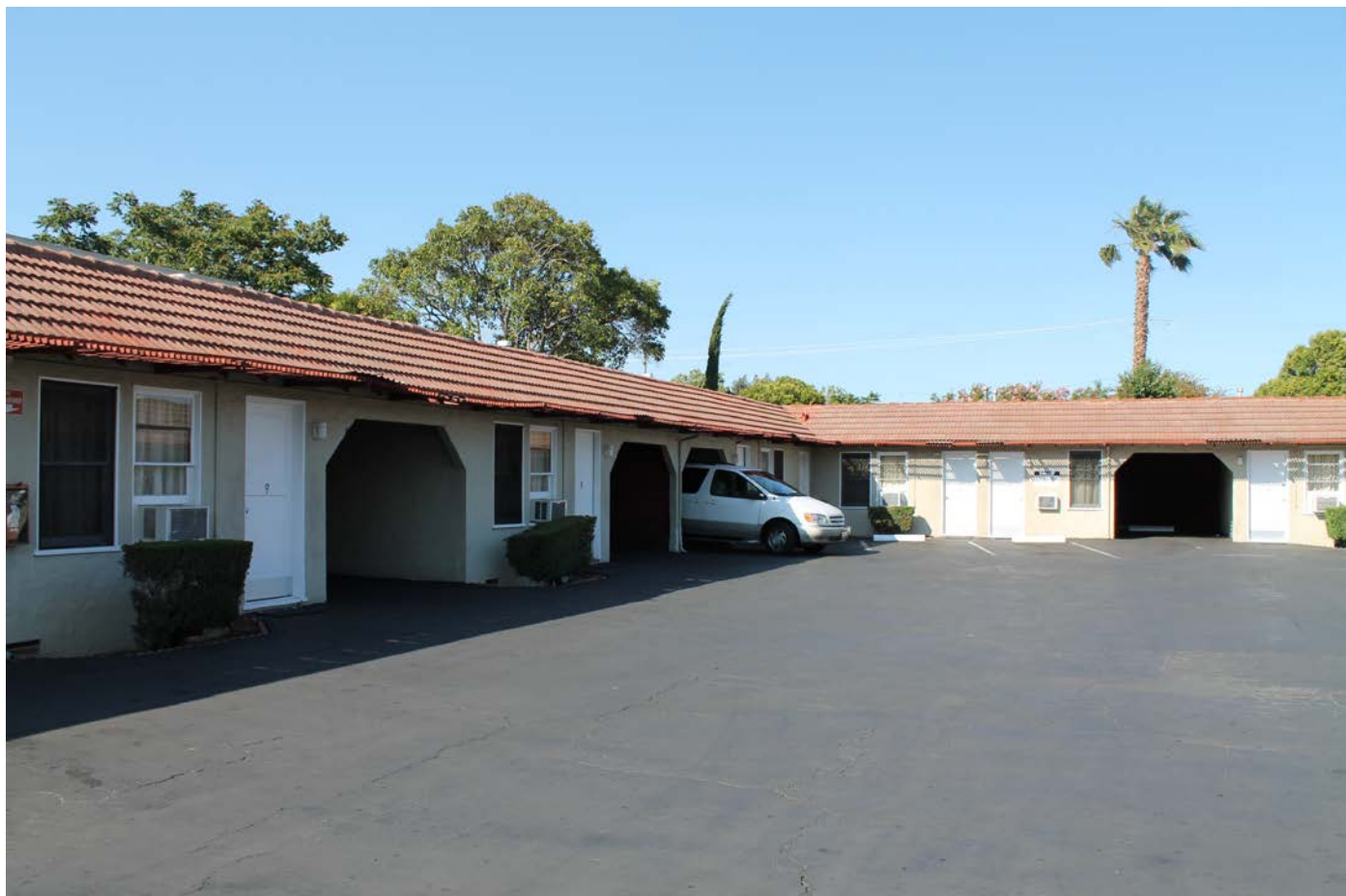
Photograph 5 1036 N. 4 th Street, San Jose

Page 8 of 23 *Resource Name or # (Assigned by recorder) 1036 N. 4 th St. San Jose *Recorded by: Urban Programmers *Date /8/11/2017 Continuation Update