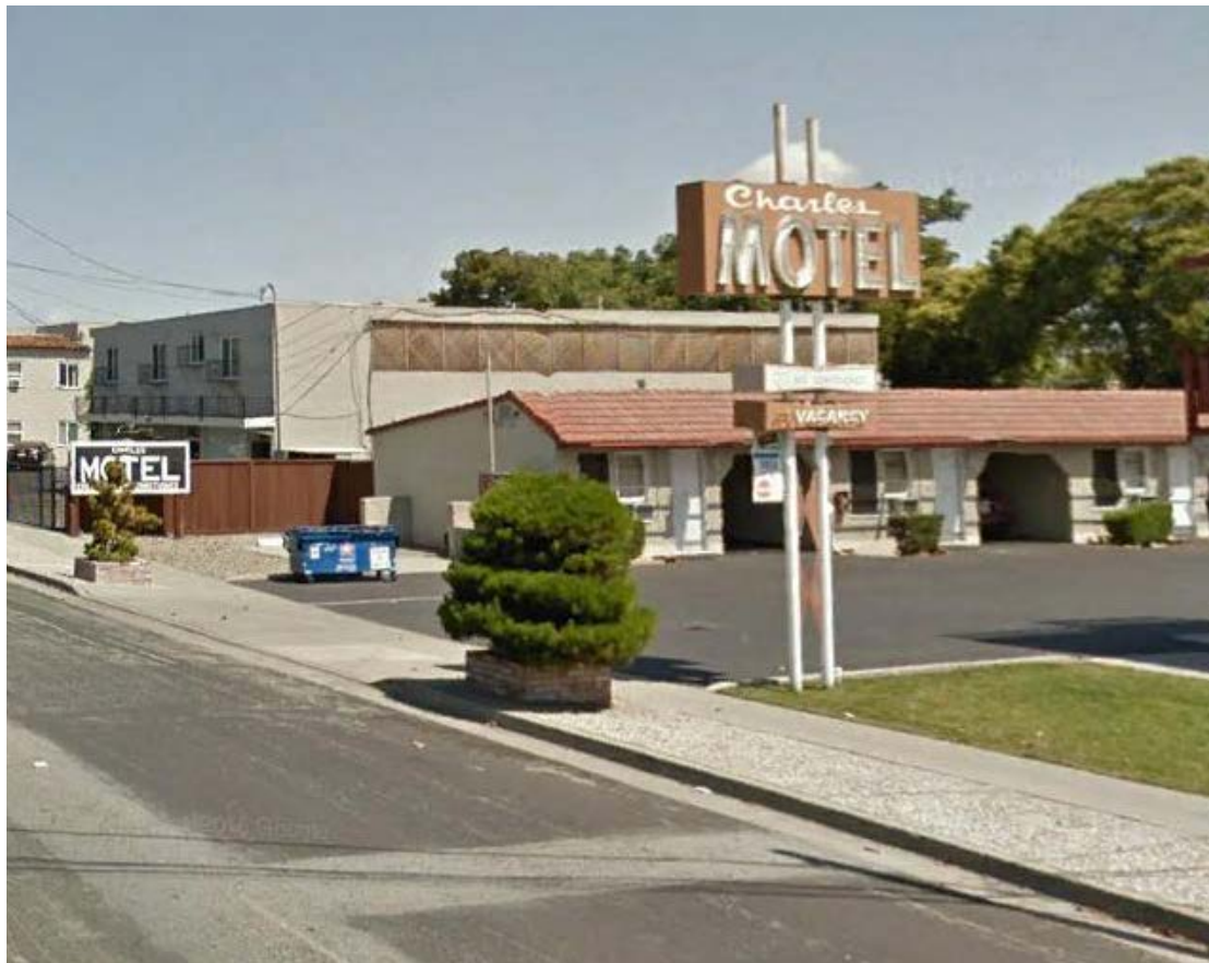
Photograph 10 1036 N. 4 th Street, San Jose View: Pole sign in front of the Charles Motel. Camera facing: NE Date: May 15, 2016

Page 13 of 23 *Resource Name or # (Assigned by recorder) 1036 N. 4 th St. San Jose *Recorded by: Urban Programmers *Date /8/11/2017 Continuation Update