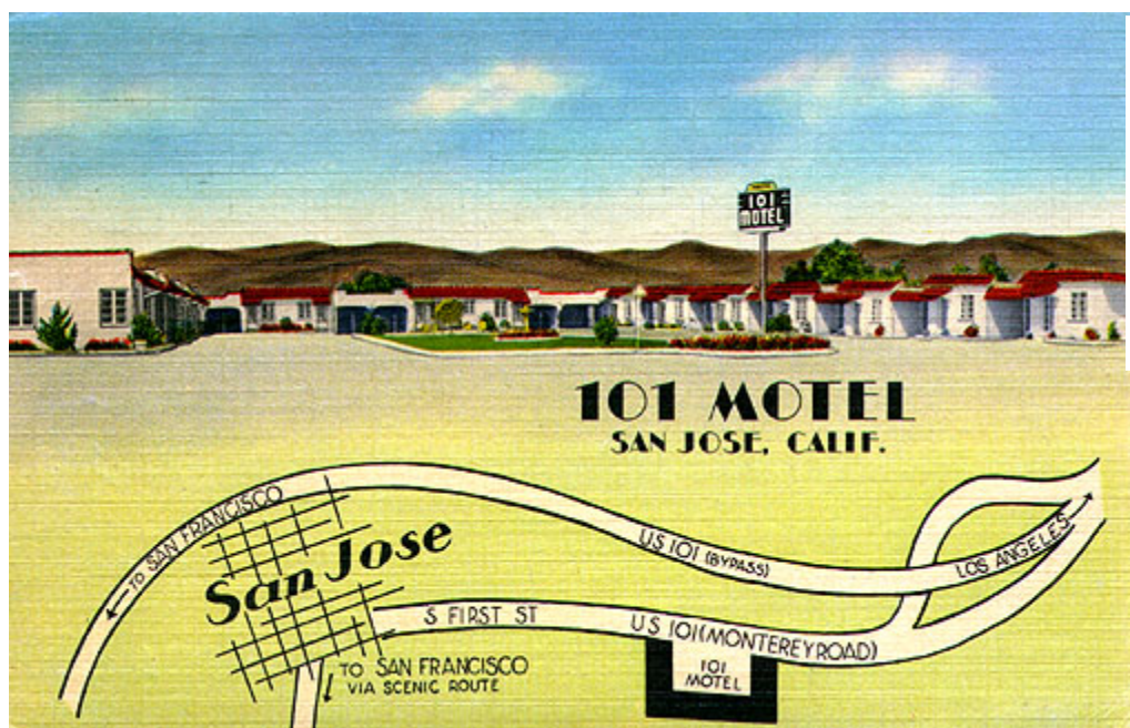
Figure 2 Historic postcard from the 101 Motel in San Jose c.1945.

During WWII building materials were scarce and at a premium, and yet there continued a need for more motels, and this brought about another significant change in design. A single concrete pad would support several “cottages” now sharing common walls, and moving the parking in the front of the unit. This was the style that continued into the post WWII design and construction during the decades of the 1940s and 1950s when the number of motels in the nation grew from 20,000 to 60,000. Thus, in the post WWII era, the most common design was a single story building of attached units that retained a small porch and/or flower boxes to give a residential feeling. The idea of a “home away from home” began to replace the experience of camping or thematic designs of the 1930s. At the end of the 1940s the motels began to add a second story with exterior corridors and stairs, and doorways became less distinctive and more uniform (hotel like). By the late 1940s most motels offered pay laundry facilities and began to add swimming pools. The swimming pool became common for new motels in the 1950s.