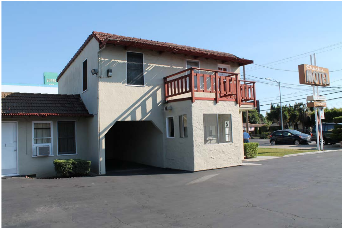
Photograph 3 1036 N. 4 th Street, San Jose View: Office and apartment addition check-in cubical and upper deck. . Pole sign on the right. Camera facing: SW Date: May 15, 2016

Page 6 of 23 *Resource Name or # (Assigned by recorder) 1036 N. 4 th St. San Jose *Recorded by: Urban Programmers *Date /8/11/2017 Continuation Update