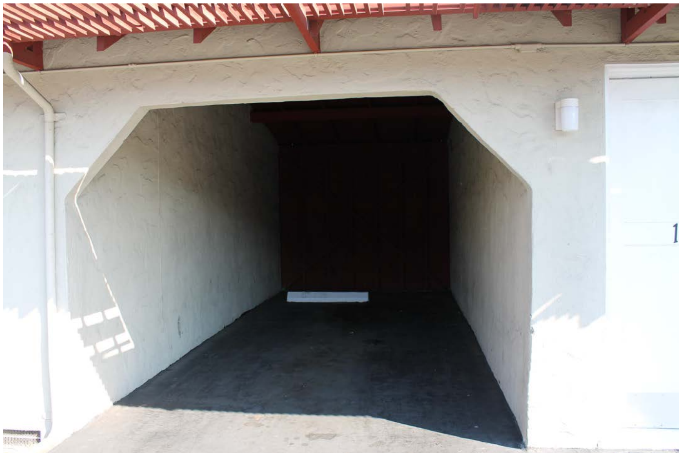
Photograph 7 1036 N. 4 th Street, San Jose View: Carport, shed shaped opening, stucco siding and concrete floor. The non-original trellis screen is above. Camera facing: SW Date: May 15, 2016

Page 10 of 23 *Resource Name or # (Assigned by recorder) 1036 N. 4 th St. San Jose *Recorded by: Urban Programmers *Date /8/11/2017 Continuation Update