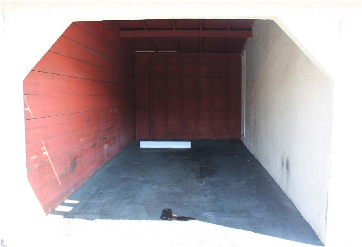
Photograph 8 1036 N. 4 th Street, San Jose

Page 11 of 23 *Resource Name or # (Assigned by recorder) 1036 N. 4 th St. San Jose *Recorded by: Urban Programmers *Date /8/11/2017 Continuation Update