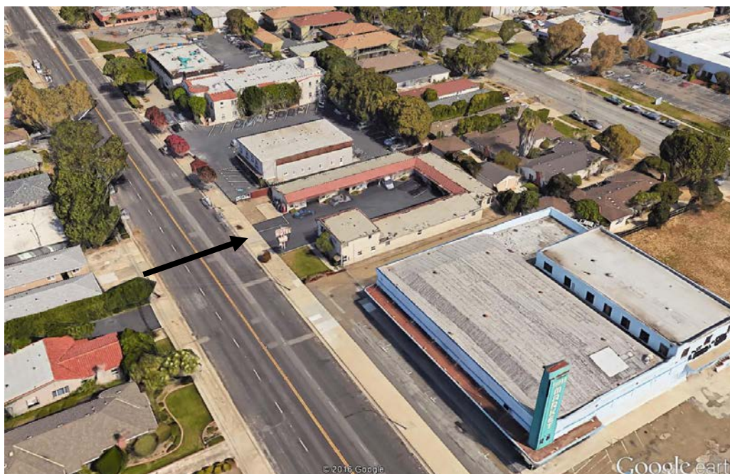
Photograph 1 1036 N. 4 th Street, San Jose View: The setting and the Charles Motel (arrow) Note changes in the roof material on the Motel. Camera facing: NE Source: Google Earth Pro, Image date May, 2015

F5b. Photographs: The Photographs were taken on May 18, 2016 at 2:00 PM using digital format.