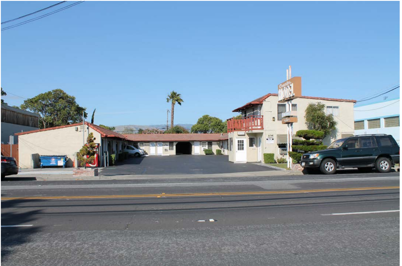
Photograph 2 1036 N. 4 th Street, San Jose

Page 5 of 23 *Resource Name or # (Assigned by recorder) 1036 N. 4 th St. San Jose *Recorded by: Urban Programmers *Date /8/11/2017 Continuation Update