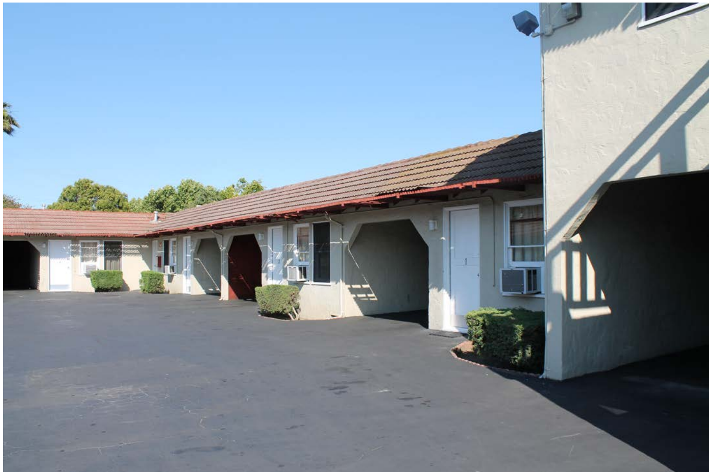
Photograph 6 1036 N. 4 th Street, San Jose View: south wing units and carports Camera facing: SE Date: July 29, 2016

Page 9 of 23 *Resource Name or # (Assigned by recorder) 1036 N. 4 th St. San Jose *Recorded by: Urban Programmers *Date /8/11/2017 Continuation Update