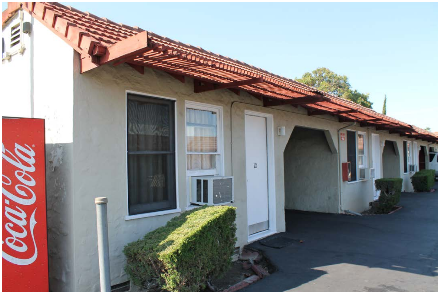
Photograph 9 1036 N. 4 th Street, San Jose View: North wing unit with carport. Trellis screen added to the front facade. Camera facing: NE Date: May 15, 2016

Page 12 of 23 *Resource Name or # (Assigned by recorder) 1036 N. 4 th St. San Jose *Recorded by: Urban Programmers *Date /8/11/2017 Continuation Update